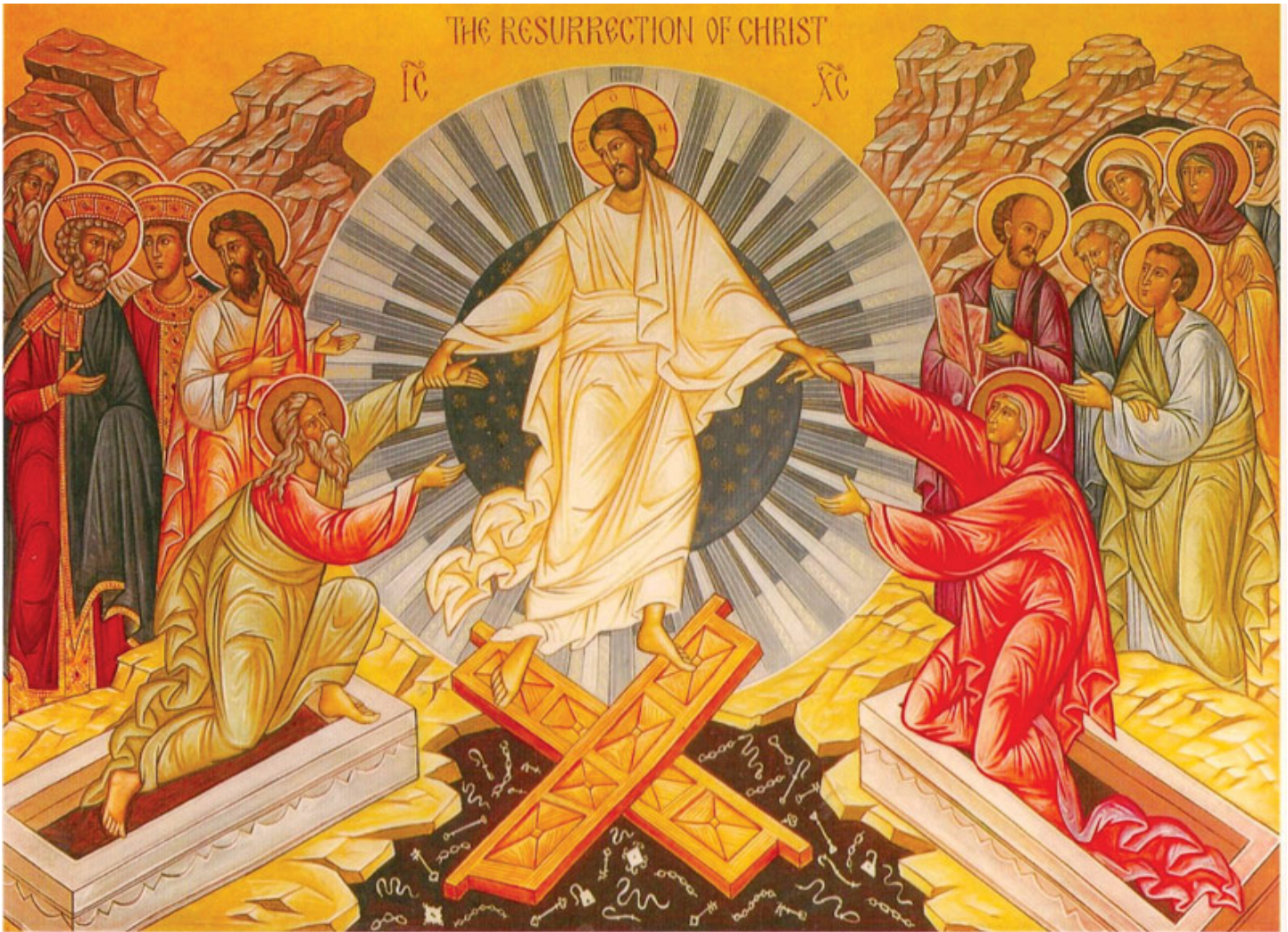
The Resurrection of Christ, an icon of the Eastern Orthodox Church